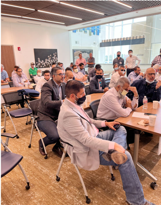
CCI Special Trade Mission from Pakistan

PCG collaborates with CCI in assisting in the organization and execution of special trade missions.