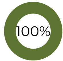
Increase in Social Media Stories Engagement

'No other cotton has our long history of innovation, transparency and high quality.'